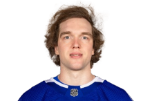
1. Andrei Vasilevskiy