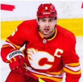
3) Mark Giordano 2005-06 – 2020-21 949