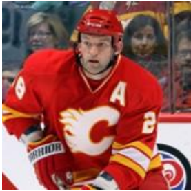
4) Robyn Regehr 1999-00 – 2010-11 826