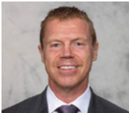
Kris Draper Former Red Wing great and four-time Stanley Cup champion