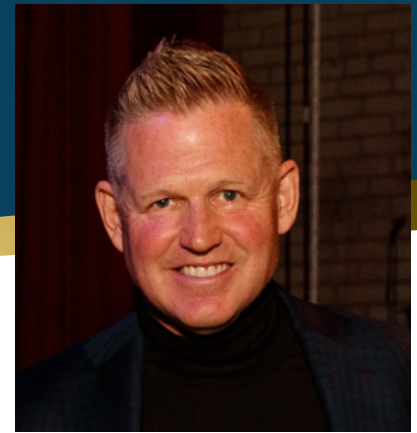
Chris Osgood Three-time Red Wing Stanley Cup Champion