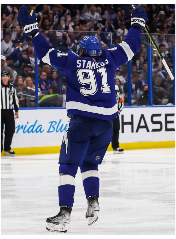
Alex Ovechkin (300) is the only active skater with more career power-play goals than Steven Stamkos.

19. Mark Recchi - 200 PPG (1,652 GP) 20. Steven Stamkos - 199 PPG (1,025 GP)