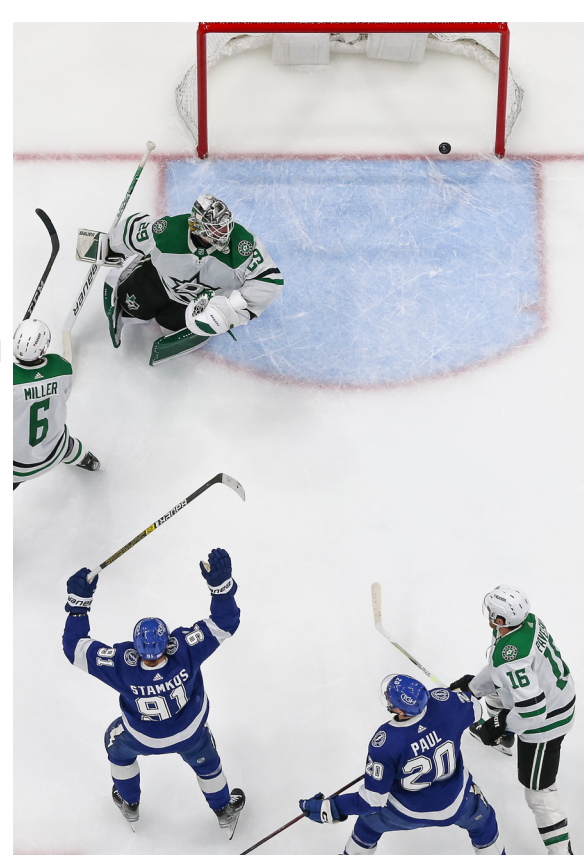
Steven Stamkos has scored 20 career goals vs. DAL, his highest goal total vs. a Western Conference opponent.