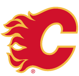
TO CALGARY 2026 third-round pick (VAN) 2025 fifth-round pick (CHI) [Conditional]