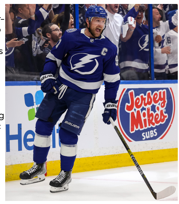
Steven Stamkos is the only player in Lightning franchise history to record 1,000 points with the club.