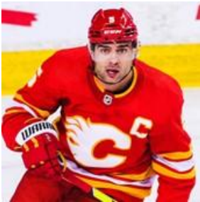
3) Mark Giordano 2005-06 – 2020-21 949