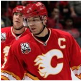
1) Jarome Iginla 1996-96 – 2012-13 1,219