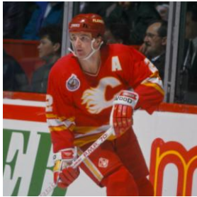
5) Al MacInnis 1981-82 – 1993-94 803