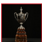
King Clancy Memorial Trophy Olie Kolzig (2005-06)