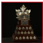
Conn Smythe Trophy Alex Ovechkin (2017-18)

Caps Picks With Hardware – Players drafted by Washington have been selected to the NHL All-Star Game 48 times while playing for the Capitals and have won the following individual awards: