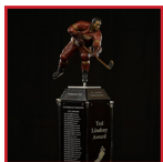
Ted Lindsay/Lester B. Pearson Award Alex Ovechkin (2007-08, 2008-09, 2009-10)