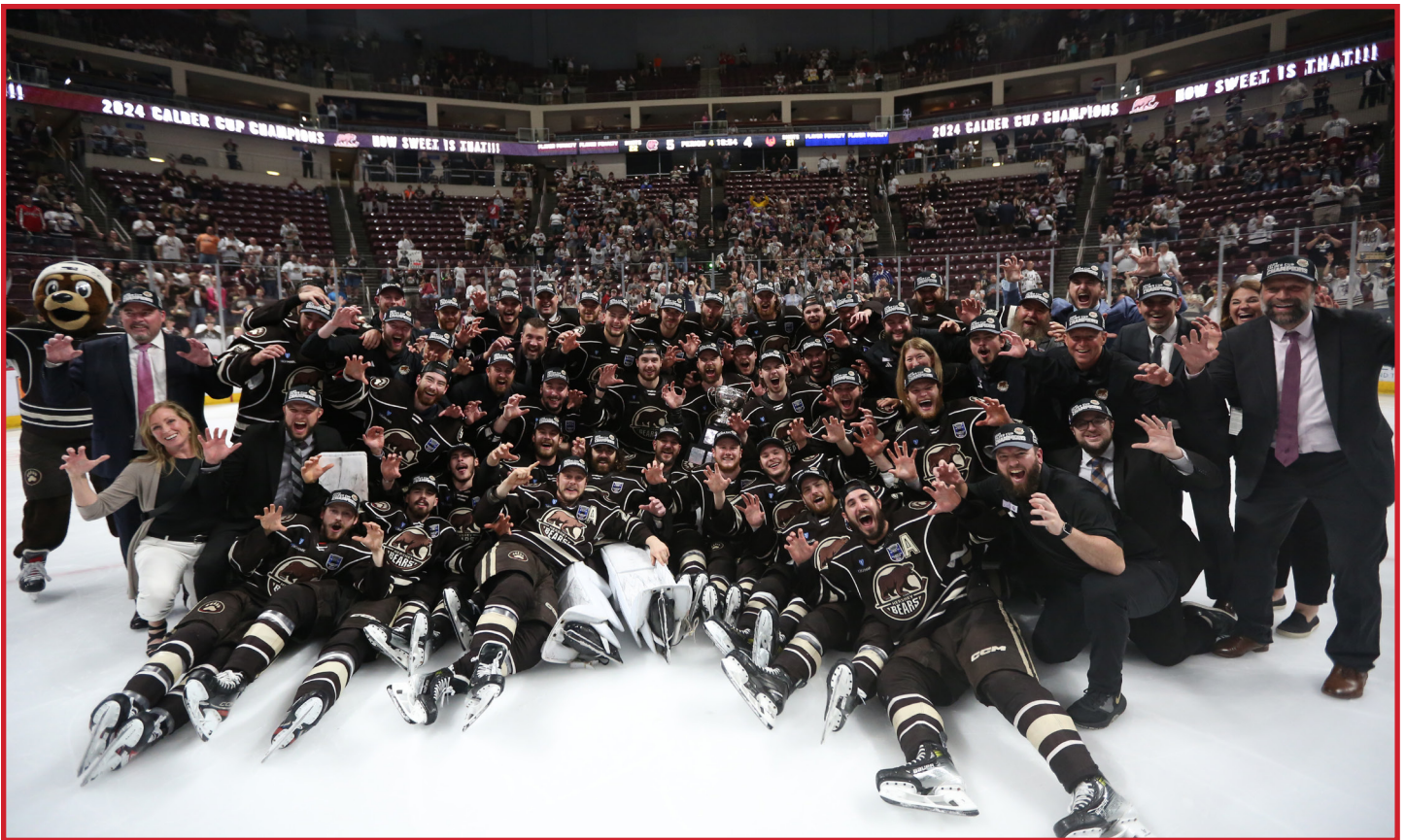
The Hershey Bears won their second-straight Calder Cup championship on June 24, 2024. It marks Hershey's fifth Calder Cup since the current affiliation with Washington began in 2005-06.