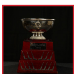
William M. Jennings Trophy Braden Holtby/Philipp Grubauer (2016-17)