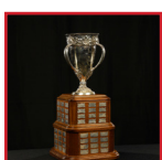
Calder Memorial Trophy Alex Ovechkin (2005-06)