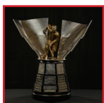
Maurice "Rocket" Richard Trophy Alex Ovechkin (2007-08, 2008-09, 2012-13, 2013-14, 2014-15, 2015-16, 2017-18, 2018-19, 2019-20)