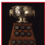
Art Ross Trophy Alex Ovechkin (2007-08)