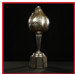
Hart Memorial Trophy Alex Ovechkin (2007-08, 2008-09, 2012-13)