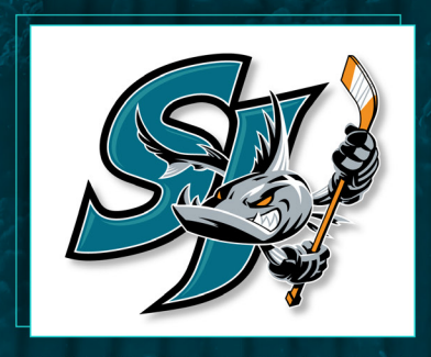
SAN JOSE BARRACUDA (AHL) 2015 - PRESENT