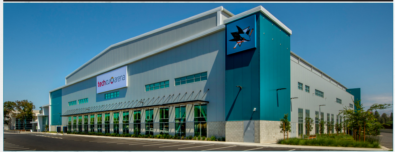
Tech CU Arena opened in August of 2022 and is the crown jewel of a 200,000 square foot expansion of the Sharks Ice at San Jose public skating facility.

Tech CU Arena has a capacity of 4,200 and included training facilities and executive office space for the Barracuda, an in-arena video board and LED display, 12 premium suites, eight loge boxes, one theatre suite, a 46-person party deck, three bar locations including one at ice level, seven food concession stations, a press room and press box and two team merchandise stores.