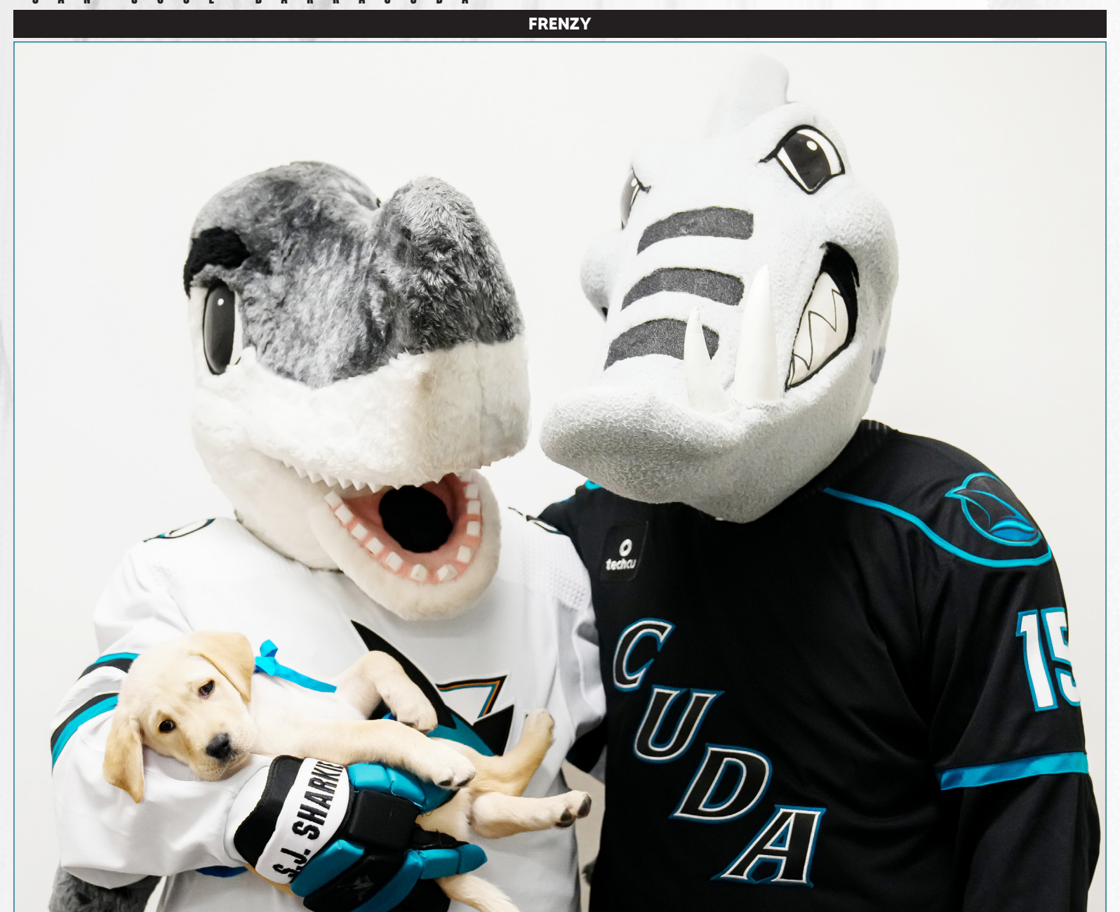
Frenzy is the official mascot of the San Jose Barracuda, created by SJ Sharkie in his secret hideout. Frenzy can be found at all Barracuda home games as well as in and around San Jose at a number of community events. School visits, youth hockey practices, birthday parties and private functions are just a few of the many places Frenzy will go. Request an appearance at https://www.sjbarracuda.com/fanzone/request-frenzy-appearance