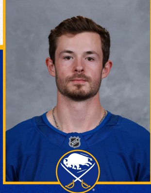
RILEY FIDDLER-SCHULTZ CENTER