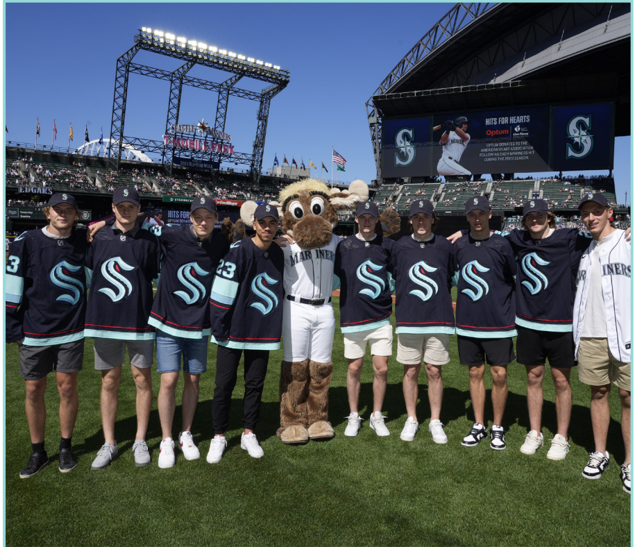
2023 SEATTLE KRAKEN DRAFT CLASS

The 2024 NHL Draft will mark the Seattle Kraken's fourth-ever entry draft and the third to be held in person, with the Sphere in Las Vegas playing host to this year's festivities. The draft will begin with the first round on Saturday, June 28 at 4 p.m. PT and will be available to watch for American viewers on ESPN and ESPN+. Rounds two through seven will continue the next day and will be broadcast on the NHL Network and ESPN+ beginning at 8:30 a.m. PT. The NHL Draft will also be broadcast on KJR 93.3, the Kraken's official radio affiliate.