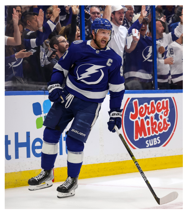
Steven Stamkos is one of just three active players with 500 career goals (also: Crosby, Ovechkin).