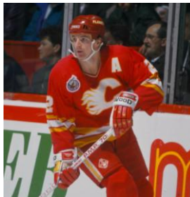
5) Al MacInnis 1981-82 – 1993-94 803