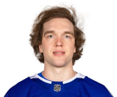
1. Andrei Vasilevskiy