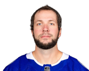
2. Nikita Kucherov