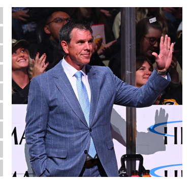
*Entering today's game