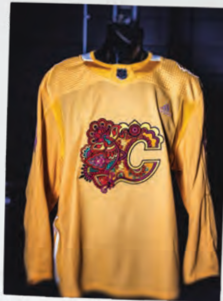
SOUTH ASIAN CELEBRATION JERSEY

Adaptable Outdoor Recreation Society AMP Legacy Foundation Of Canada Black Girls Hockey Club Calgary Cerebral Palsy Association Calgary RAGE Womens Football Canadian Association For Disabled Skiing Fast And Female Supporting Women In Sport Foundation Flames AMP Community Champs Football Hockey Link Society Hockey Education Reaching Out Society (HEROS) KidsPlay Youth Foundation Paralympic Sports Association Medicine Hat Chapter Special Olympics Canada Start2Finish Straz Strong Foundation The Calgary Foundation Variety The Children's Charity Of Alberta Vecova Centre For Disability Services And Research Wheelchair Sports Association Alberta YMCA Floor Hockey for Newcomers