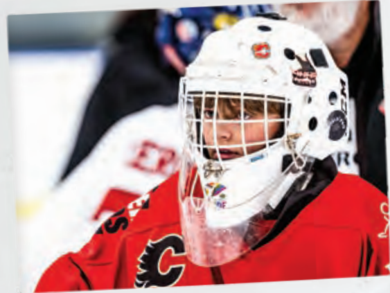
HEROS AND SUPERHEROS

HEROS is using hockey as a catalyst for at-risk youth and SuperHEROS is Calgary's first on-ice program for youth with cognitive and physical challenges.