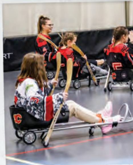
AMP ROLLER SLEDGE HOCKEY