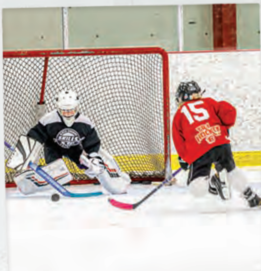
FLAMES TRY HOCKEY

270+ of those participants registered for Jr. Flames