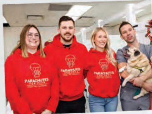
PARACHUTES FOR PETS