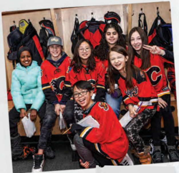
FLAMES FUTURE GOALS