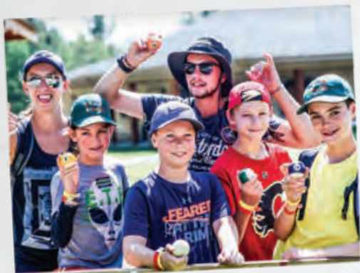
KIDS CANCER CARE PEER PROGRAM + CAMP KINDLE