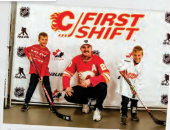
FLAMES FIRST SHIFT

This initiative aims to make hockey more accessible and affordable, offering a practical introduction to the sport. Participants receive a comprehensive package that includes a full set of Bauer hockey equipment and six one-hour on-ice sessions for a subsidized fee.