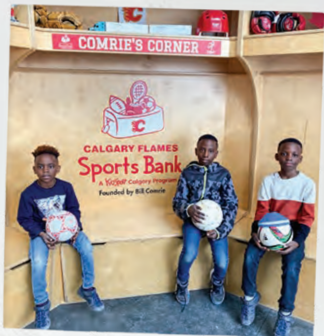
CALGARY FLAMES SPORTS BANK

541 participants $373,426 in financial assistance for registration fees