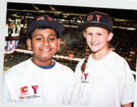
FLAMES YMCA GRADE 6 PROGRAM