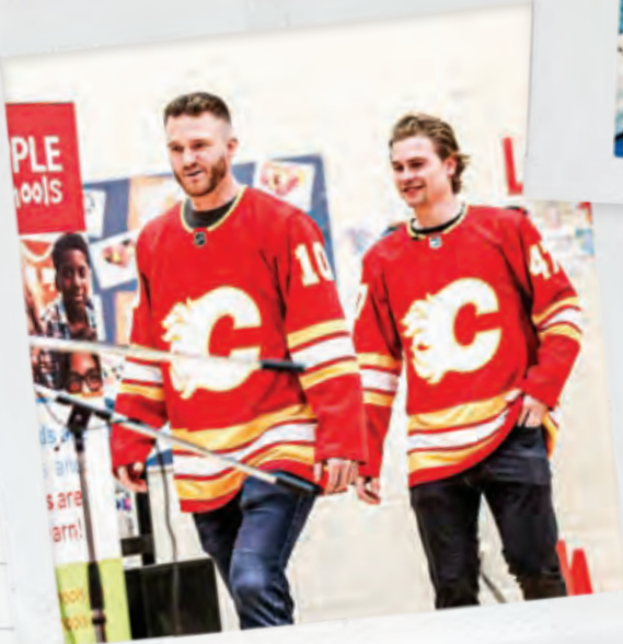
APPLE SCHOOLS FUELING HEALTHY FUTURES