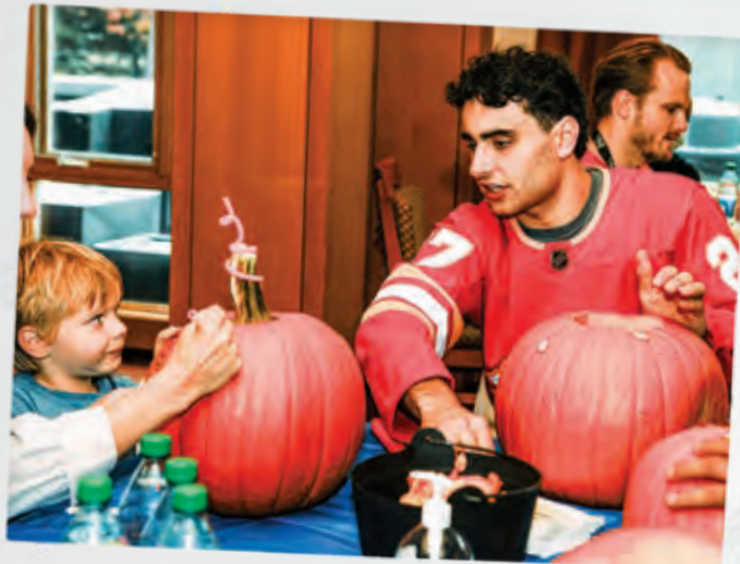
PUMPKIN CARVING AT ALBERTA CHILDREN'S HOSPITAL