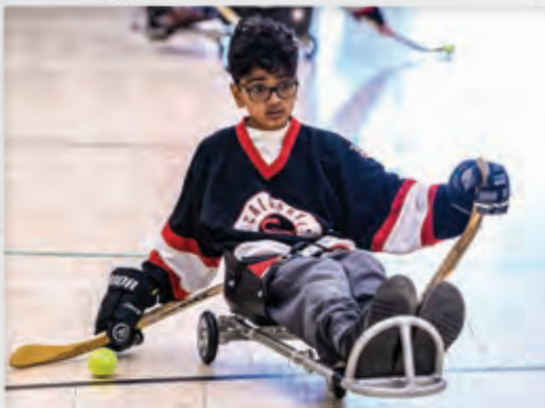
AMP ROLLER SLEDGE HOCKEY