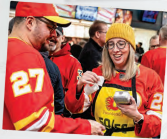
CALGARY FLAMES FOUNDATION 50/50 SELLER ON THE CONCOURSE

Local amateur and grassroots sports teams and organizations are also provided the opportunity to raise funds with concourse raffle ticket sales.