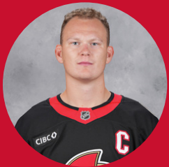
Brady Tkachuk, Ottawa Senators Captain

“This community is so amazing. I find that getting to be a source of happiness, role model, and a positive influence for kids, is really important to me.”