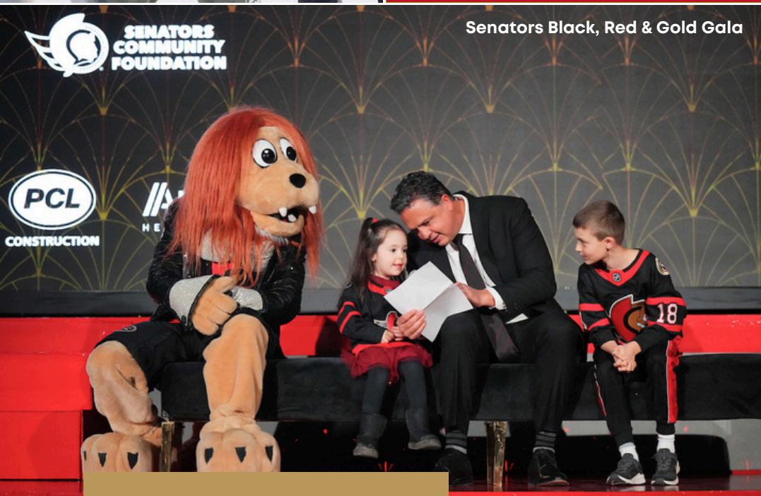
Senators Black, Red & Gold Gala