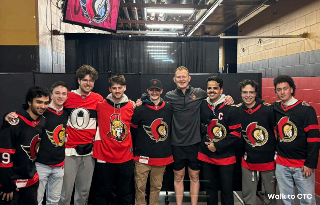
Walk to CTC