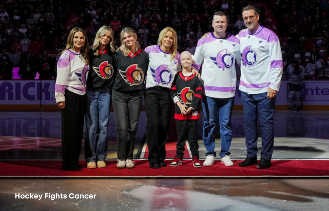
Hockey Fights Cancer