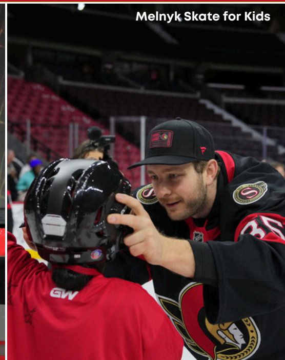
Melnyk Skate for Kids