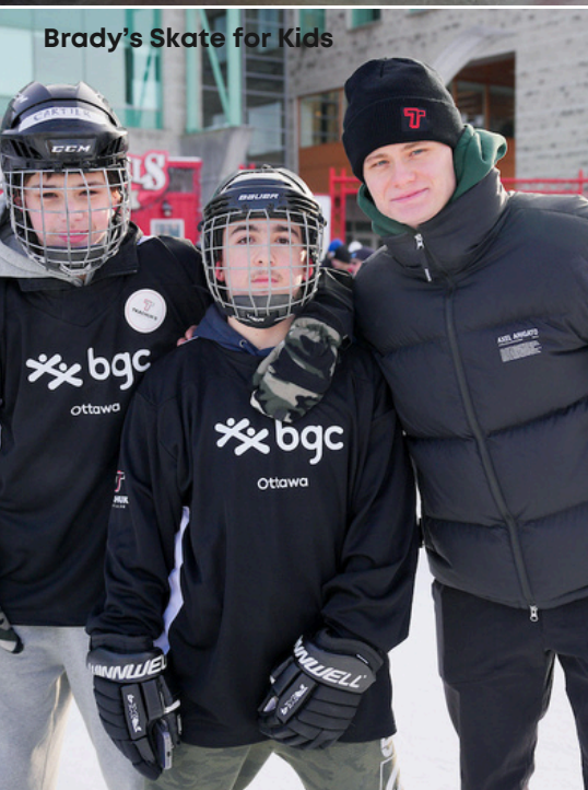
Brady's Skate for Kids

"The amount of happiness and energy that I get from these kids is immeasurable. You can really see we are making a difference in the moment. We are getting them away from all the worries, all the thoughts about the past, the future and help them just be in the now."