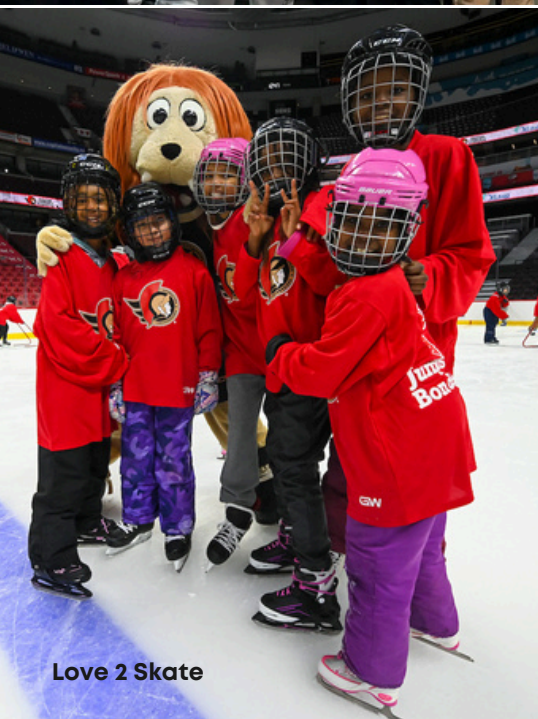
Love 2 Skate

"Hockey was never just a sport for me; it was the bridge that ignited my love for Canadian culture and community. I am privileged to have grown through the sport, first as a participant and now as a Hockey 4 Youth Program Coordinator, giving back to the journey that made me fall in love with this country. Thank you the Senators Community Foundation for your support of our girls in Ottawa."