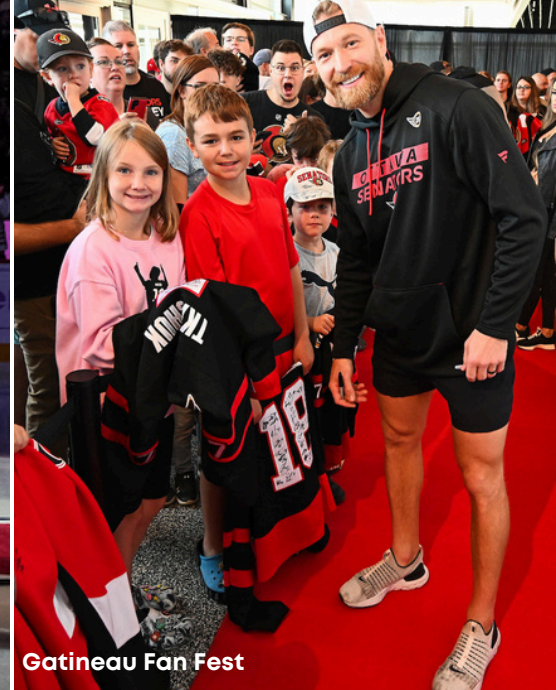
Gatineau Fan Fest