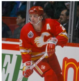
5) Al MacInnis 1981-82 – 1993-94 803