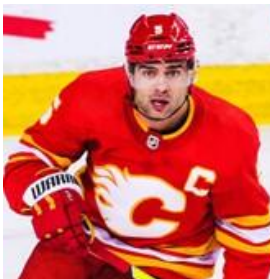
3) Mark Giordano 2005-06 – 2020-21 949