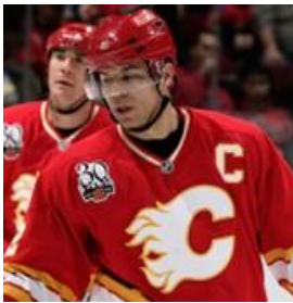
1) Jarome Iginla 1996-96 – 2012-13 1,219