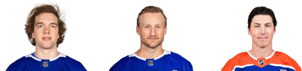
1. Andrei Vasilevskiy 2. Steven Stamkos 3. Ryan Nugent-Hopkins