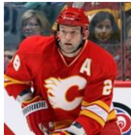
4) Robyn Regehr 1999-00 – 2010-11 826