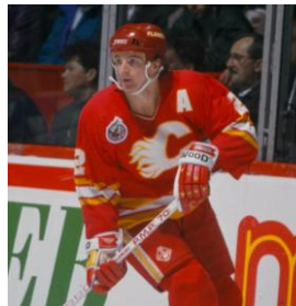
5) Al MacInnis 1981-82 – 1993-94 803