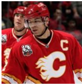
1) Jarome Iginla 1996-96 – 2012-13 1,219