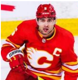
3) Mark Giordano 2005-06 – 2020-21 949