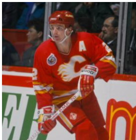
5) Al MacInnis 1981-82 – 1993-94 803