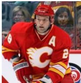
4) Robyn Regehr 1999-00 – 2010-11 826